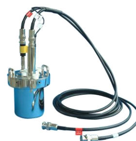
Adaptor & Cable for DAC-OBE-2