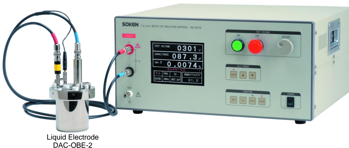
Liquid Electrode DAC-OBE-2

DAC-IM-D6 measures capacitance and the dielectric loss tangent ( \tan \delta ) of electrical insulating materials with resolution of 1 ppm ( 1 \times 10^{-6} ). Measurements in accordance with IEC standards (IEC 60247 and IEC 60554-2) are available by using with an optional liquid or sheet or other appropriate electrode. Furthermore, the relative permittivity of an insulating material can be displayed by saving the capacitance of an empty electrode into memory.